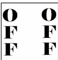
Wuzzle No. 2