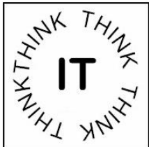
Wuzzle No. 4

This year's Okaloosa Island Food Pantry Drive achieved a total of 360 pounds of donated food. The food was delivered to the local Ft Walton Beach foodbank, Sharing and Caring, on December 22.