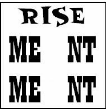
Wuzzle No. 1

WUZZLE PUZZLES - What is a Wuzzle Puzzle? It is a puzzle consisting of combinations of words, letters, figures, or symbols positioned to create disguised words, phrases, names, places, etc. Are you ready to take the challenge and figure out the "disguised" meaning of these wuzzles? Good luck.